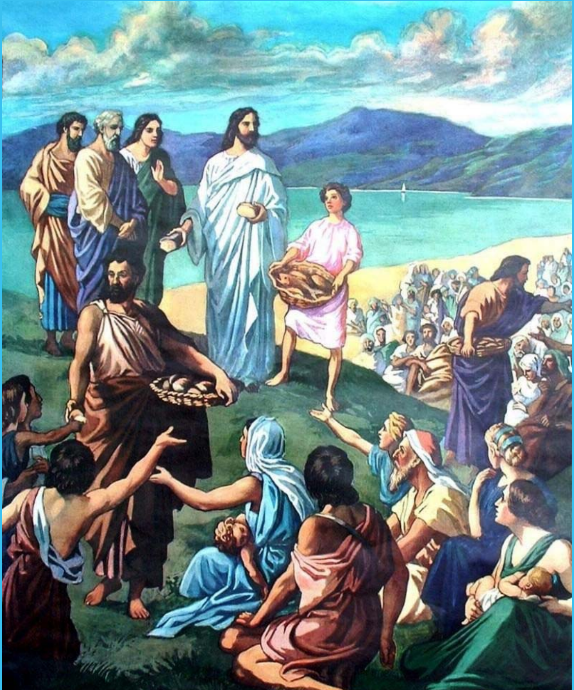
The Feeding Of The Five-Thousand